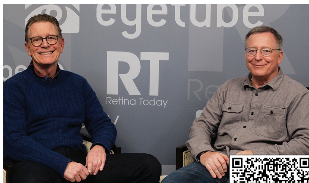
Video 1. Three Decades of Surgical Training

surgical training, and, for 3D visualization in particular, “it gives me more comfort in allowing my fellows to go further during surgery,” he said.